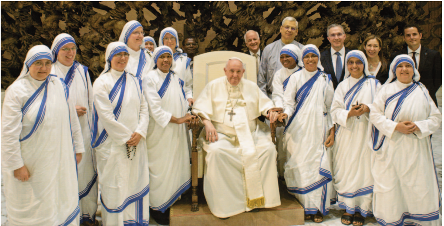
Pope Francis greeted Missionaries of Charity and a delegation of the Knights of Columbus Aug. 31, prior to the world premiere of Mother Teresa: No Greater Love at the Filmoteca Vaticana.

Like St. Teresa of Calcutta, the Knights are committed to lives of service. And last year, in countless ways, we channeled our faith into charity.