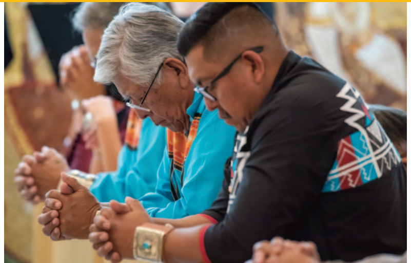
Above left: Pope Francis kisses the hand of an Indigenous leader during a meeting with First Nations, Métis and Inuit communities in Maskwacis, Alberta. The Supreme Council provided financial support and local Knights stepped up in various roles of assistance during the Holy Father's penitential pilgrimage to Canada last year. • Right: Participants pray during a Mass celebrating the 10-year anniversary of the canonization of St. Kateri Tekakwitha at the Saint John Paul II National Shrine on Oct. 21.

In the Middle East, we continue to aid persecuted Christians. Without our work, some of the most ancient Christian communities might have disappeared forever. But they're still here, and since 2014, we've provided more than $33 million to help them build for the future.