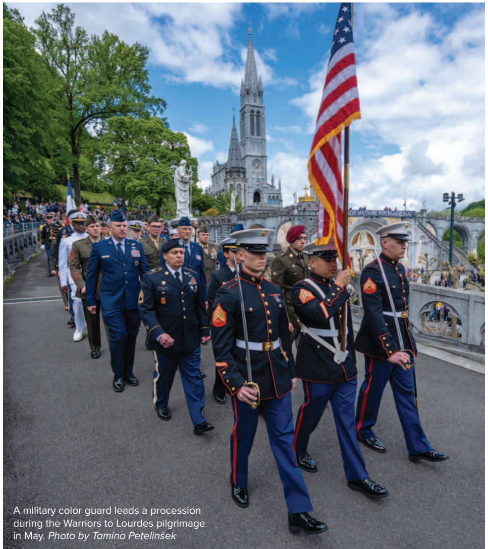
A military color guard leads a procession during the Warriors to Lourdes pilgrimage in May.

Like all of you, I was shocked to see a professional baseball team honor an anti-Catholic hate group that masquerades as nuns. They mock Our Lord and Our Lady in the foulest ways. And they insult the courageous women religious who have dedicated their lives to prayer and service. I can think of no more blatant example of the new anti-Catholic bigotry.