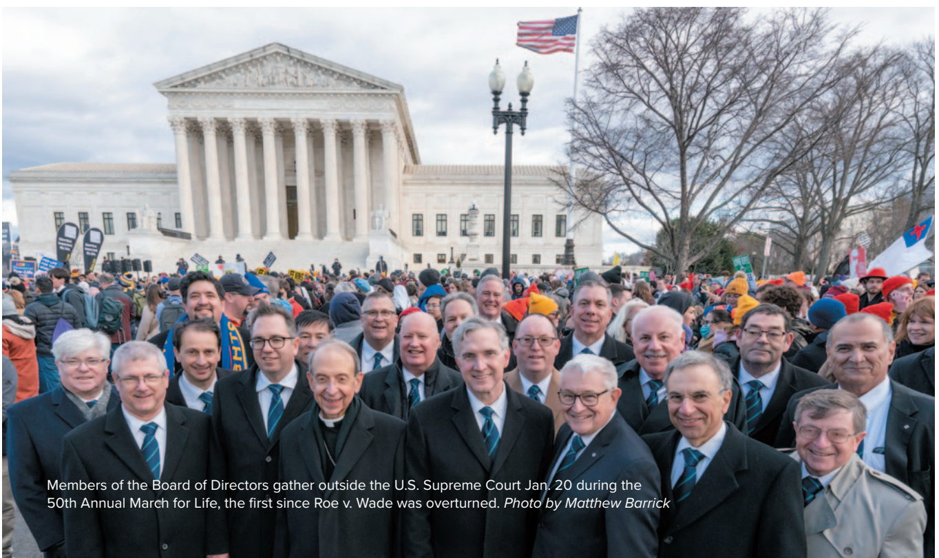
Members of the Board of Directors gather outside the U.S. Supreme Court Jan. 20 during the 50th Annual March for Life, the first since Roe v. Wade was overturned.