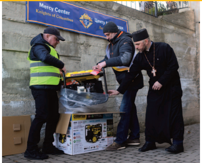
Members of Blessed Noël Pinot Council 16722 in Angers, France, serve breakfast to a man experiencing homelessness. Inspired by a saying of St. Vincent de Paul — “the poor are your masters” — the Knights bring breakfast to homeless people every Saturday at dawn. Photo by Arnaud Bouthéon • Members of St. Demetrius Council 17293 in Ivano-Frankivsk, including council chaplain Father Andriy Rehner, unpack a generator for the local parish. Knights have donated 200 generators to help power parishes across Ukraine. Photo by Andrey Gorb

In Virginia, brother Knights didn’t just buy wheelchairs for veterans. They delivered them in person. At one VA facility, they showed up with 20 wheelchairs for disabled heroes.